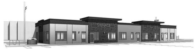
NORTHBRIDGE BUSINESS CENTRE -