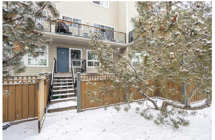
107-3615 49 St NW, Calgary, AB

Main Building: Total Exterior Area Above Grade 404.85 sq ft