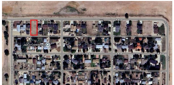
Town of Bassano Vacant Property Listing Details

BEAUTIFUL BASSANO - Welcome to an incredible opportunity to build your dream home in vibrant Bassano for only $5,000! This prime lot has all town services conveniently run to the property line, ready for your vision. Enjoy Bassano's charming community with an outdoor pool, local arena, parks, and a revitalized downtown. Buyers must submit a development permit application within 6 months of signing for a taxable improvement per LUB 921/21. There is also a build timeline requirement. Allowed property types include Prefab Homes and Stick Build. Mobile homes are NOT allowed. Call now to get more information as we have multiple lots available!