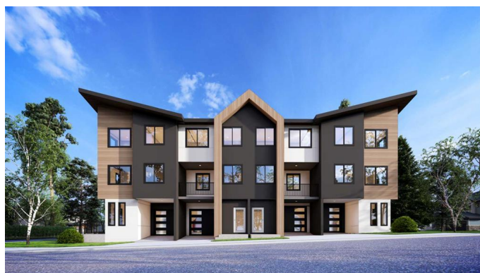
97 23 St NW, Calgary, AB

Thoughtfully designed with high-end finishes, this home showcases luxury vinyl plank flooring, elegant feature walls, premium tiles, upgraded carpet, and a designer backsplash. The single attached garage adds to the convenience.