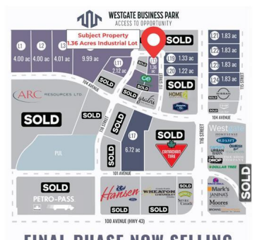
FINAL PHASE NOW SELLING